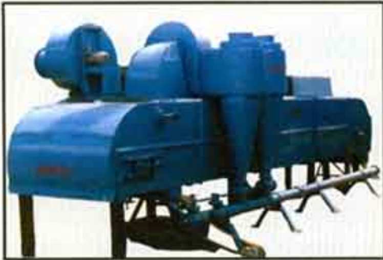
DRIER COOLER / MEAL COOLER